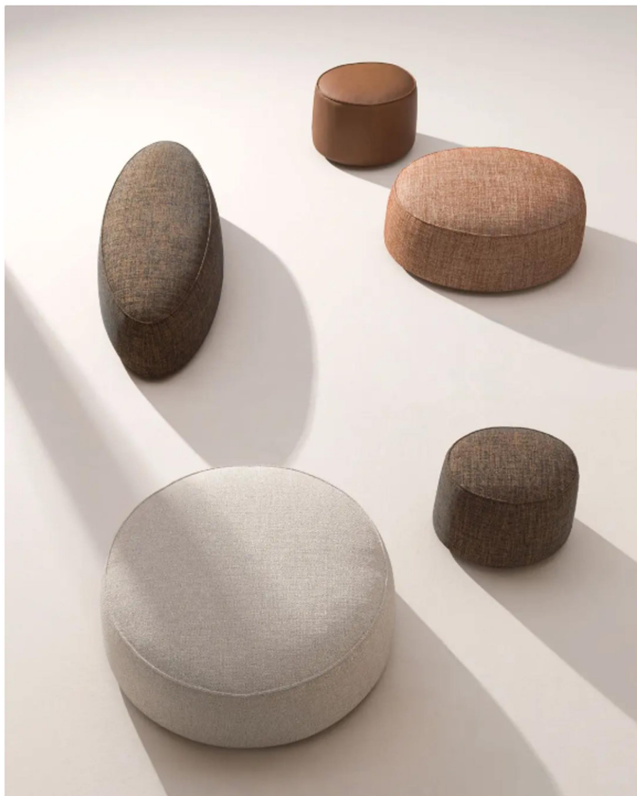
Pond poufs by Setsu & Shinobu Ito

These pieces reveal the profound connections between two distinct design traditions — Italian and Japanese — bound by mutual respect and a shared philosophy. The quiet beauty that permeates Japanese aesthetics feels at once familiar and distant: on one hand, it evokes a sense of home; on the other, it expresses a spiritual harmony between human beings and nature that is truly unparalleled. Respect for the environment, sensitivity to light and material, devotion to craftsmanship, and a continual pursuit of balance between sensoriality and restraint, order and complexity — these are the values interwoven into the designers' work and brought to life through Desiree's creations.