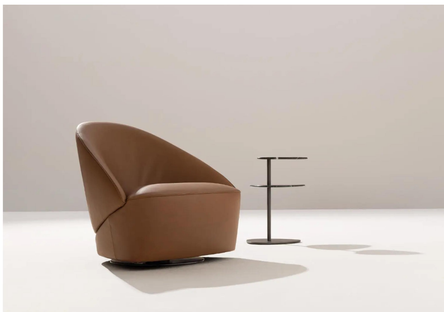
TE armchair by Setsu & Shinobu Ito

Alongside it, the Pond poufs inhabit the space like natural elements. Their soft, organic silhouettes — outlined by a raised seam that traces their contours — evoke the fluidity of water. They can serve as surfaces for resting objects, informal seats, or small islands of relaxation: multifunctional pieces conceived for a dynamic, contemporary living environment.