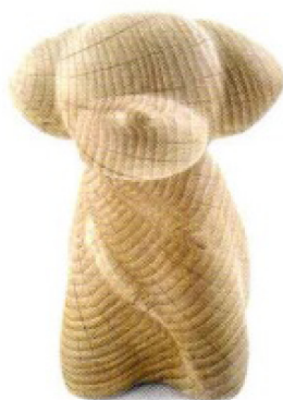
Alongside, Wan, a cedar wood dog designed by Setsu and Shinobu Ito for Riva 1920. Above, created for Désirée, Tè chairs with wooden frame and curved wooden back.